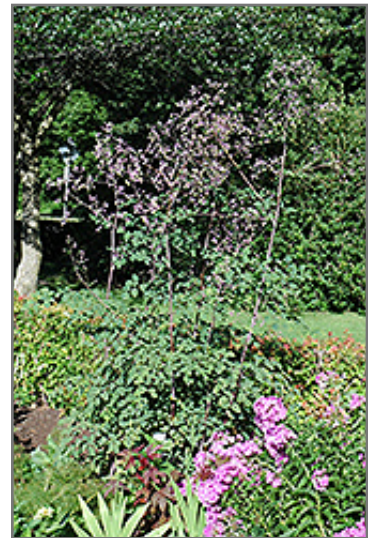
Rochebrun Meadow Rue in bloom