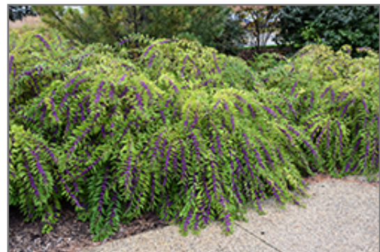
Issai Beautyberry fruit