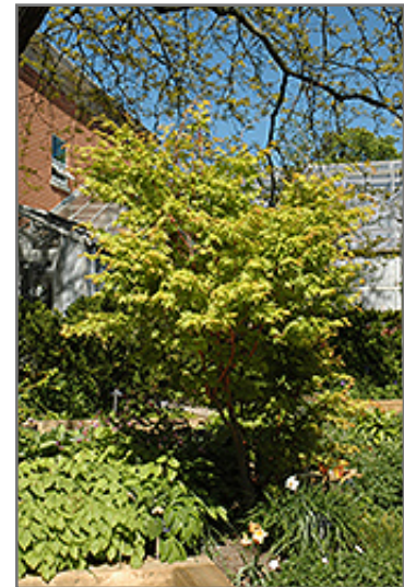
Coral Bark Japanese Maple