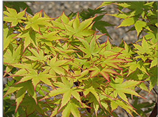
Coral Bark Japanese Maple foliage

This is a relatively low maintenance tree, and should only be pruned in summer after the leaves have fully developed, as it may 'bleed' sap if pruned in late winter or early spring. It has no significant negative characteristics.