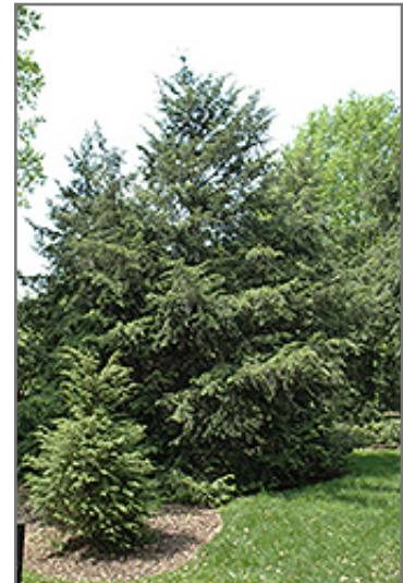
Canadian Hemlock

Canadian Hemlock is recommended for the following landscape applications;