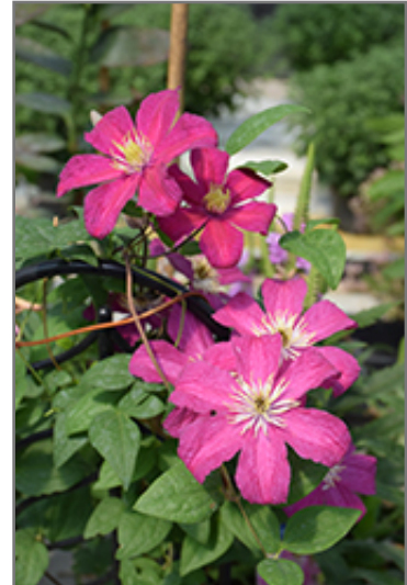
Barbara Harrington Clematis flowers