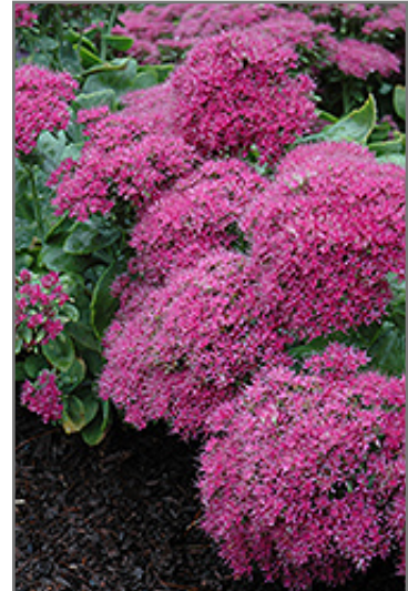
Neon Stonecrop flowers

Neon Stonecrop is a dense herbaceous perennial with an upright spreading habit of growth. Its relatively coarse texture can be used to stand it apart from other garden plants with finer foliage.