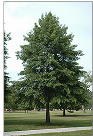
Pin Oak