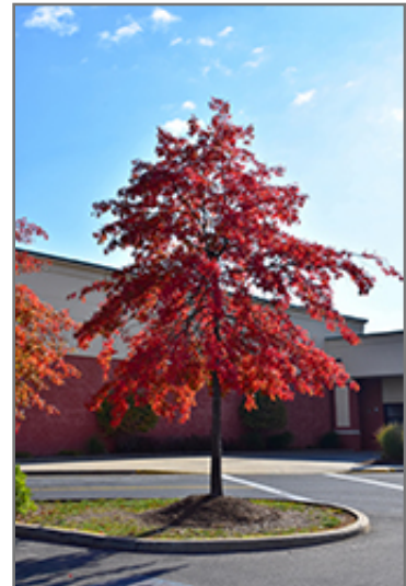
Pin Oak in fall

Pin Oak is recommended for the following landscape applications;