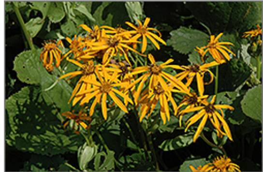
Othello Rayflower flowers