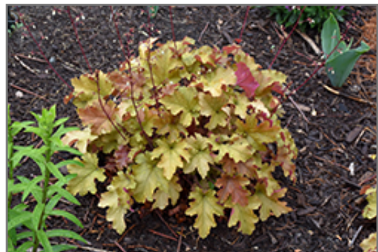
Marmalade Coral Bells