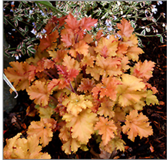
Marmalade Coral Bells foliage

Marmalade Coral Bells will grow to be about 8 inches tall at maturity extending to 18 inches tall with the flowers, with a spread of 16 inches. When grown in masses or used as a bedding plant, individual plants should be spaced approximately 14 inches apart. Its foliage tends to remain low and dense right to the ground. It grows at a medium rate, and under ideal conditions can be expected to live for approximately 10 years. As an evergreen perennial, this plant will typically keep its form and foliage year-round.