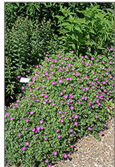
Max Frei Cranesbill in bloom