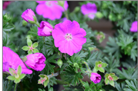
Max Frei Cranesbill flowers