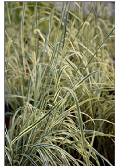
Shining Star Bluestem foliage

This is a relatively low maintenance plant, and is best cut back to the ground in late winter before active growth resumes. It has no significant negative characteristics.