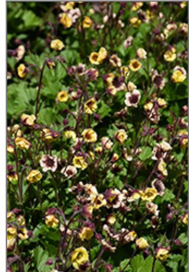
Tempo Yellow Avens flowers

Tempo Yellow Avens is recommended for the following landscape applications;