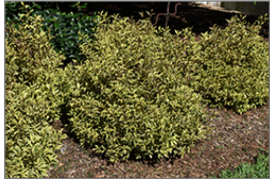
Bubbly Wine Weigela

Bubbly Wine Weigela will grow to be about 24 inches tall at maturity, with a spread of 3 feet. It tends to fill out right to the ground and therefore doesn't necessarily require facer plants in front. It grows at a medium rate, and under ideal conditions can be expected to live for approximately 30 years.