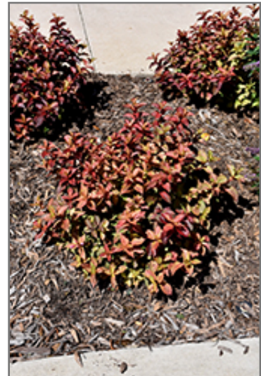
Midnight Sun Reblooming Weigela