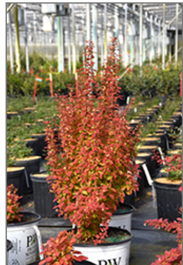
Sunjoy Orange Pillar Japanese Barberry