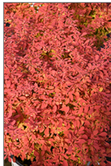
Sunjoy Neo Japanese Barberry foliage

Sunjoy Neo Japanese Barberry is recommended for the following landscape applications;