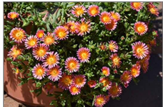
Ocean Sunset Orange Glow Ice Plant flowers