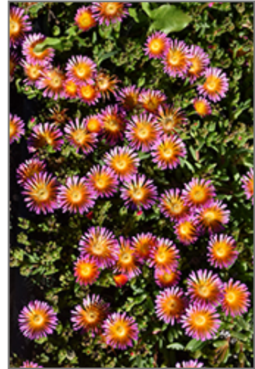
Ocean Sunset Orange Glow Ice Plant flowers

Ocean Sunset Orange Glow Ice Plant is a fine choice for the garden, but it is also a good selection for planting in outdoor pots and containers. Because of its spreading habit of growth, it is ideally suited for use as a 'spiller' in the 'spiller-thriller-filler' container combination; plant it near the edges where it can spill gracefully over the pot. Note that when growing plants in outdoor containers and baskets, they may require more frequent waterings than they would in the yard or garden.