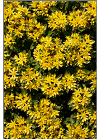
Rock 'N Round Bright Idea Stonecrop flowers

This is a relatively low maintenance plant, and is best cleaned up in early spring before it resumes active growth for the season. It is a good choice for attracting bees and butterflies to your yard, but is not particularly attractive to deer who tend to leave it alone in favor of tastier treats. It has no significant negative characteristics.