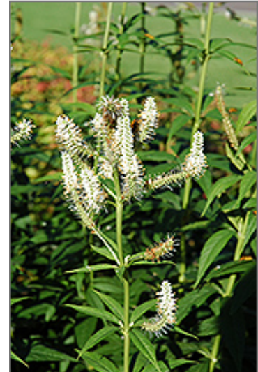
Culver's Root flowers