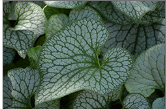
Sterling Silver Bugloss foliage

Sterling Silver Bugloss will grow to be about 12 inches tall at maturity, with a spread of 24 inches. When grown in masses or used as a bedding plant, individual plants should be spaced approximately 20 inches apart. It grows at a medium rate, and under ideal conditions can be expected to live for approximately 10 years. As an herbaceous perennial, this plant will usually die back to the crown each winter, and will regrow from the base each spring. Be careful not to disturb the crown in late winter when it may not be readily seen!