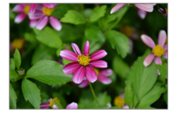
Cupcake Strawberry Bidens flowers