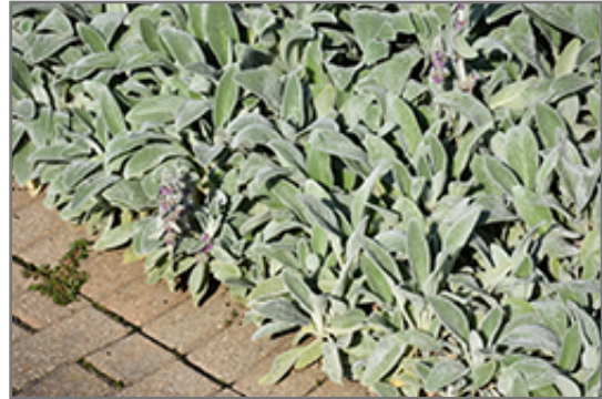
Lamb's Ears

Lamb's Ears is a fine choice for the garden, but it is also a good selection for planting in outdoor pots and containers. It can be used either as 'filler' or as a 'thriller' in the 'spiller-thriller-filler' container combination, depending on the height and form of the other plants used in the container planting. Note that when growing plants in outdoor containers and baskets, they may require more frequent waterings than they would in the yard or garden.