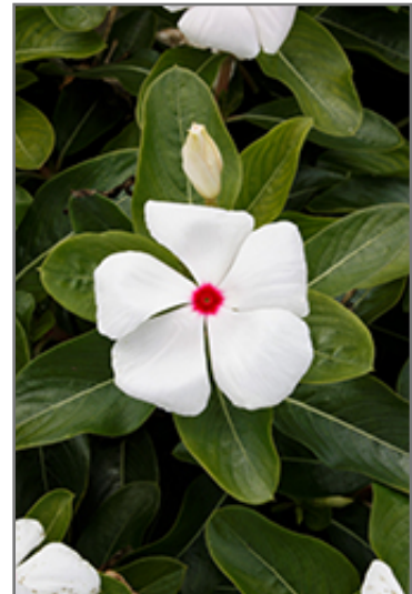
Cora Cascade Polka Dot Vinca flowers

Cora Cascade Polka Dot Vinca is recommended for the following landscape applications;