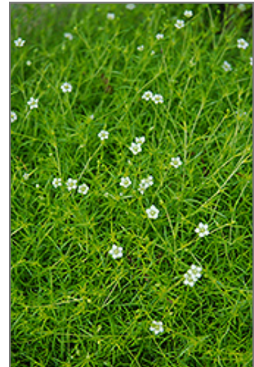
Scotch Moss flowers