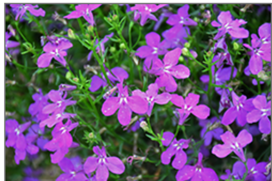
Hot Purple Lobelia flowers