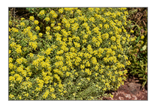
Mountain Alyssum flowers

Mountain Alyssum is recommended for the following landscape applications;