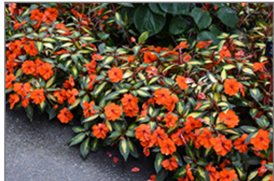
SunPatiens Vigorous Tropical Orange New Guinea Impatiens in bloom