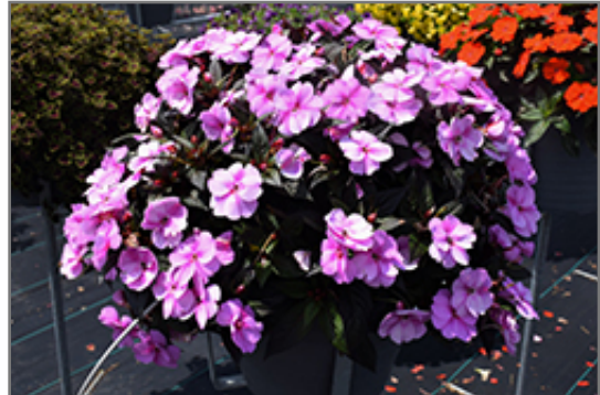
SunPatiens Vigorous Lavender Splash New Guinea Impatiens in bloom

SunPatiens Vigorous Lavender Splash New Guinea Impatiens is a fine choice for the garden, but it is also a good selection for planting in outdoor containers and hanging baskets. Because of its height, it is often used as a 'thriller' in the 'spiller-thriller-filler' container combination; plant it near the center of the pot, surrounded by smaller plants and those that spill over the edges. It is even sizeable enough that it can be grown alone in a suitable container. Note that when growing plants in outdoor containers and baskets, they may require more frequent waterings than they would in the yard or garden.