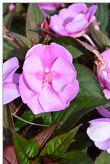
SunPatiens Vigorous Lavender Splash New Guinea Impatiens flowers