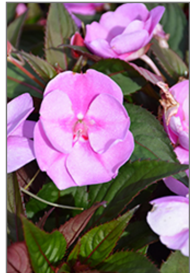
SunPatiens Vigorous Lavender Splash New Guinea Impatiens flowers