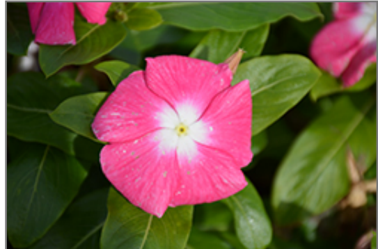
Cora XDR Pink Halo flowers

Cora XDR Pink Halo is recommended for the following landscape applications;