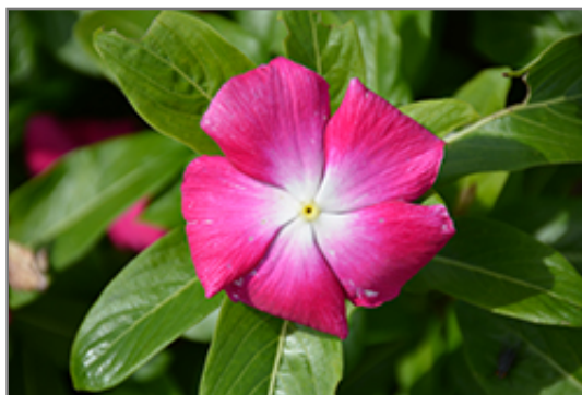
Cora XDR Magenta Halo flowers

10300 E. 9000 N Road Grant Park, IL 60940 Phone: 1-815-465-6310 Fax: 1-815-465-6396