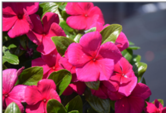
Cora XDR Hotgenta flowers

This plant will require occasional maintenance and upkeep, and should not require much pruning, except when necessary, such as to remove dieback. It is a good choice for attracting butterflies to your yard, but is not particularly attractive to deer who tend to leave it alone in favor of tastier treats. It has no significant negative characteristics.