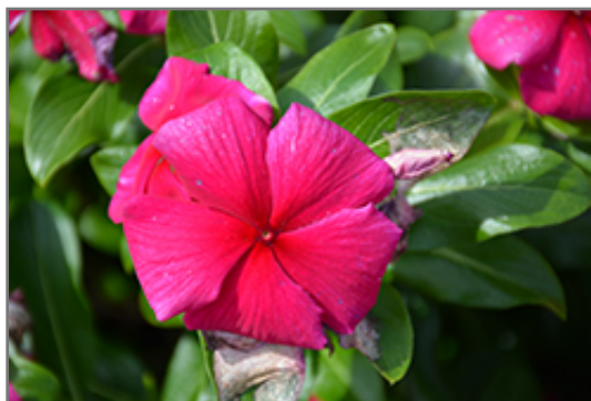
Cora XDR Hotgenta flowers

10300 E. 9000 N Road Grant Park, IL 60940 Phone: 1-815-465-6310 Fax: 1-815-465-6396