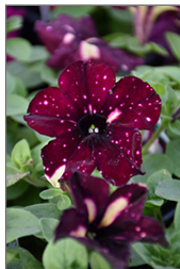
Headliner Starry Sky Burgundy Petunia flowers

10300 E. 9000 N Road Grant Park, IL 60940 Phone: 1-815-465-6310 Fax: 1-815-465-6396