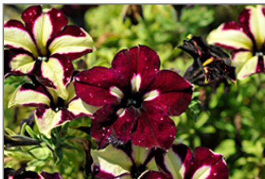
Headliner Starry Sky Burgundy Petunia flowers

Headliner Starry Sky Burgundy Petunia is a dense herbaceous annual with a mounded form. Its medium texture blends into the garden, but can always be balanced by a couple of finer or coarser plants for an effective composition.