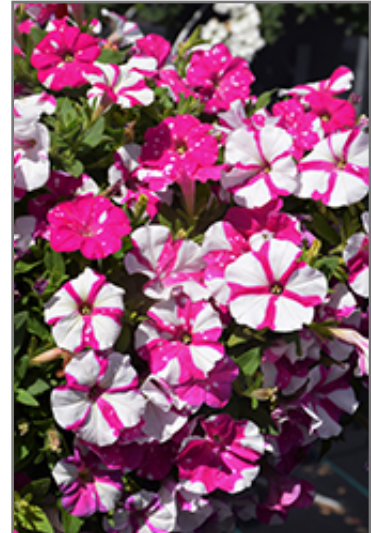
Headliner Pink Sky Petunia flowers

Headliner Pink Sky Petunia is recommended for the following landscape applications;