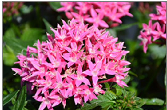
Lucky Star Deep Pink Star Flower flowers