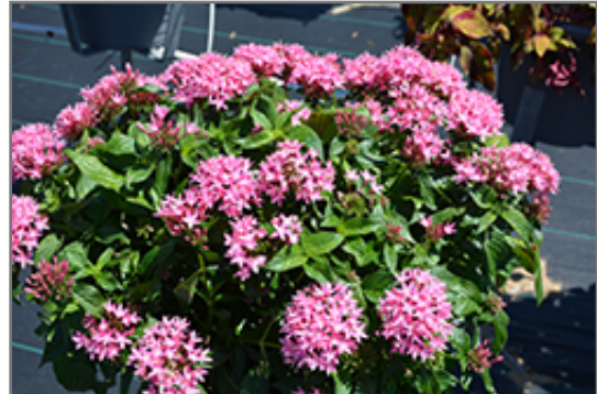
Lucky Star Deep Pink Star Flower in bloom

Lucky Star Deep Pink Star Flower will grow to be about 12 inches tall at maturity, with a spread of 14 inches. When grown in masses or used as a bedding plant, individual plants should be spaced approximately 10 inches apart. Its foliage tends to remain dense right to the ground, not requiring facer plants in front. This fast-growing annual will normally live for one full growing season, needing replacement the following year.