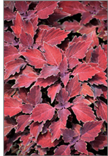
ColorBlaze Royale Cherry Brandy Coleus foliage

ColorBlaze Royale Cherry Brandy Coleus is recommended for the following landscape applications;