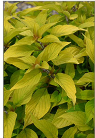
Rockin' Golden Delicious foliage

Rockin' Golden Delicious is recommended for the following landscape applications;