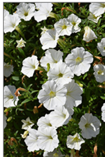
Supertunia Vista Snowdrift Petunia flowers

10300 E. 9000 N Road Grant Park, IL 60940 Phone: 1-815-465-6310 Fax: 1-815-465-6396