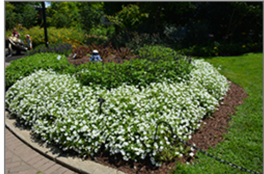
Supertunia Vista Snowdrift Petunia in bloom