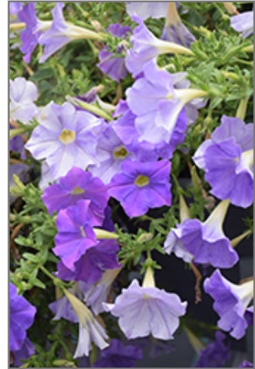
Supertunia Blue Skies Petunia flowers

This plant will require occasional maintenance and upkeep. Trim off the flower heads after they fade and die to encourage more blooms late into the season. It is a good choice for attracting butterflies and hummingbirds to your yard, but is not particularly attractive to deer who tend to leave it alone in favor of tastier treats. It has no significant negative characteristics.