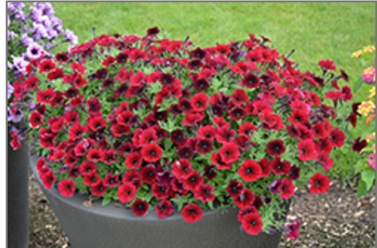
Supertunia Black Cherry Petunia in bloom