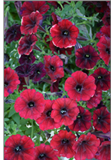
Supertunia Black Cherry Petunia flowers

Supertunia Black Cherry Petunia is a dense herbaceous annual with a trailing habit of growth, eventually spilling over the edges of hanging baskets and containers. Its medium texture blends into the garden, but can always be balanced by a couple of finer or coarser plants for an effective composition.