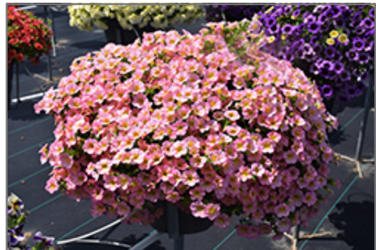
Superbells Honeyberry Calibrachoa in bloom