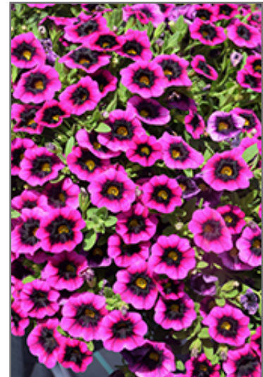
Superbells Blackcurrent Punch Calibrachoa flowers

This plant will require occasional maintenance and upkeep. Trim off the flower heads after they fade and die to encourage more blooms late into the season. It is a good choice for attracting bees and hummingbirds to your yard, but is not particularly attractive to deer who tend to leave it alone in favor of tastier treats. It has no significant negative characteristics.