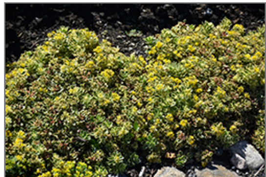
Rock 'N Low Boogie Woogie Stonecrop in bloom