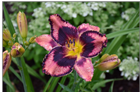
Rainbow Rhythm Storm Shelter Daylily flowers