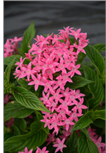
Lucky Star Pink Star Flower flowers