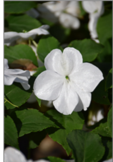
Beacon White Impatiens flowers

Beacon White Impatiens is recommended for the following landscape applications;