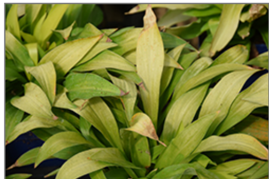
Munchkin Fire Hosta foliage