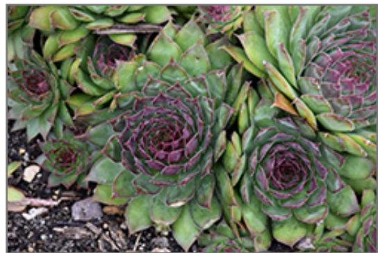
Black Hens And Chicks