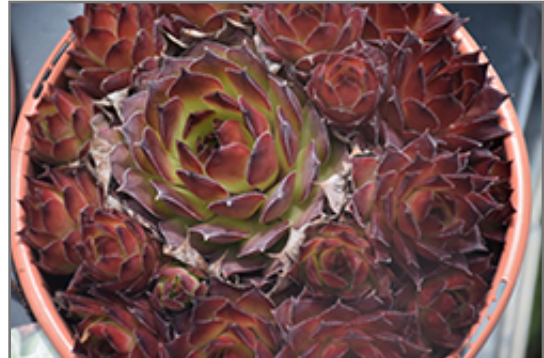
Black Hens And Chicks