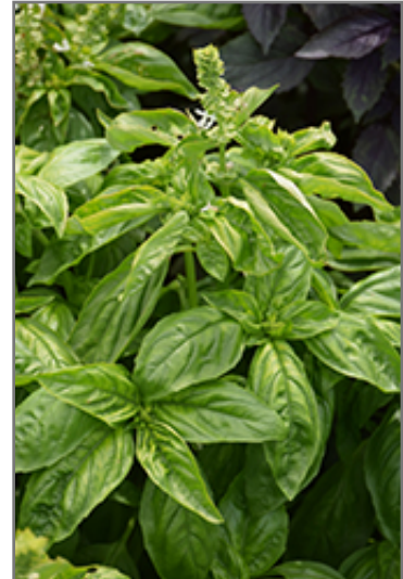
Genovese Basil foliage

Genovese Basil will grow to be about 20 inches tall at maturity, with a spread of 14 inches. When grown in masses or used as a bedding plant, individual plants should be spaced approximately 12 inches apart. This fast-growing annual will normally live for one full growing season, needing replacement the following year.