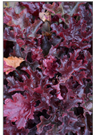
Dolce Cherry Truffles Coral Bells foliage