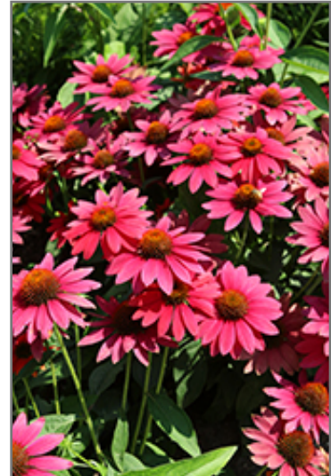
Sombrero Tres Amigos Coneflower flowers

Sombrero Tres Amigos Coneflower is an herbaceous perennial with an upright spreading habit of growth. Its medium texture blends into the garden, but can always be balanced by a couple of finer or coarser plants for an effective composition.